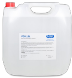
PDS-10L BS-040107-FK DNA/RNA Decontamination Solution 10l